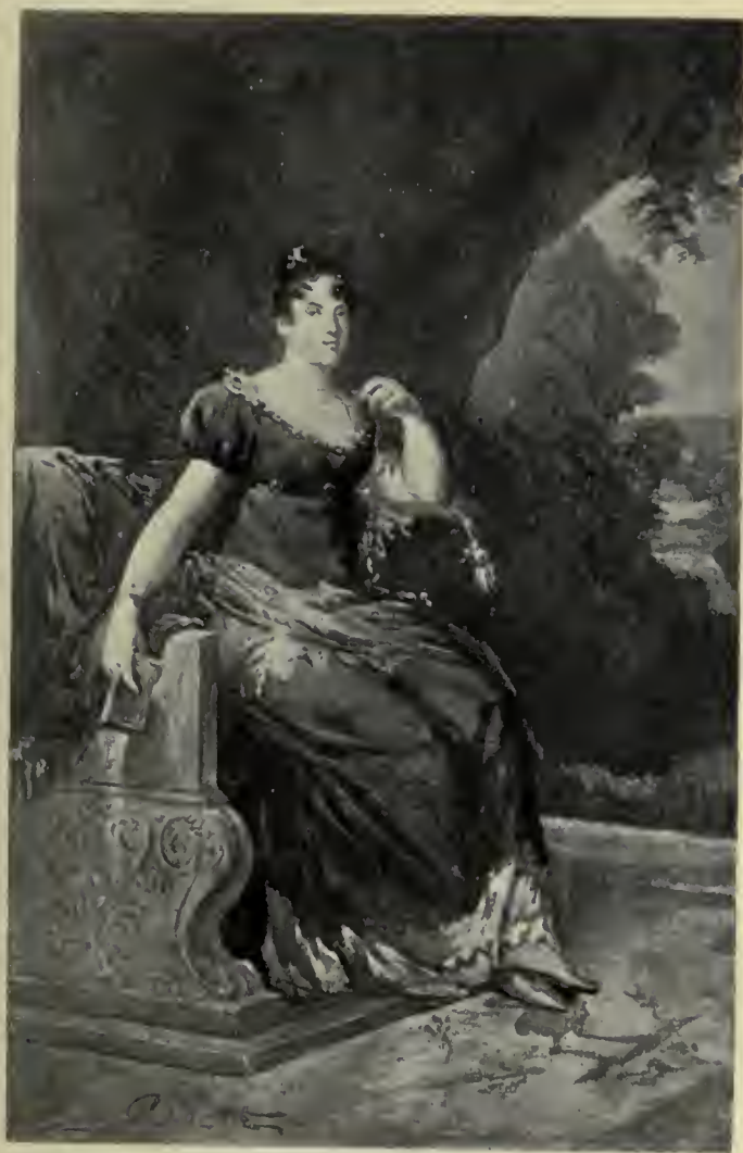
CATHERINE OF WÜRTEMBERG.